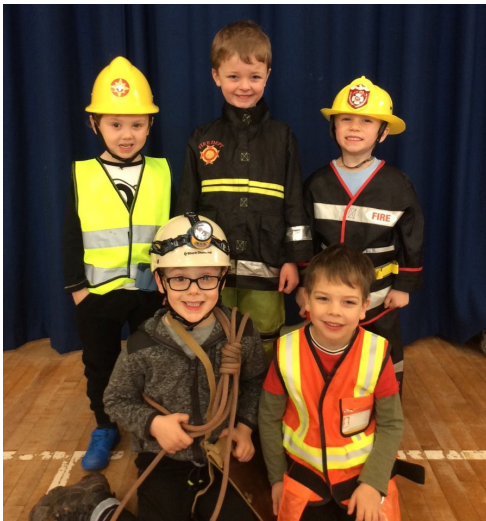
Pupils from our Reception Class

On Friday 23rd February our Reception, Year 1 and Year 2 pupils and staff supported the Pied Piper 999 Emergency Fancy Dress Day Appeal. Thank you for your help - the pupils looked amazing and had a fabulous day learning all about the great work of our emergency services. The school raised £86 for this great charity.