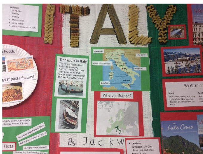
A great project all about Italy - well done Jack