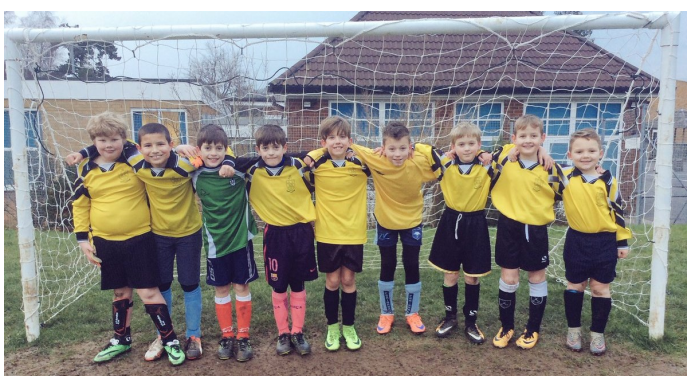
Well done to the B Team