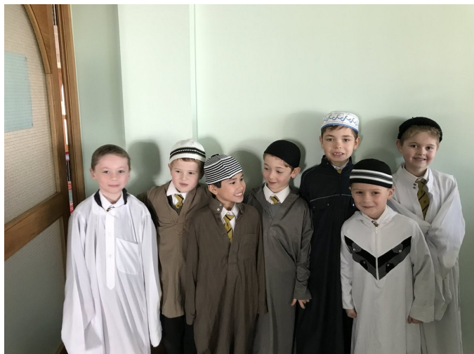
Year 2 pupils visiting the local Mosque