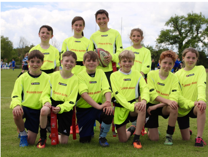
Highnam Academy Team 1 — Runners Up