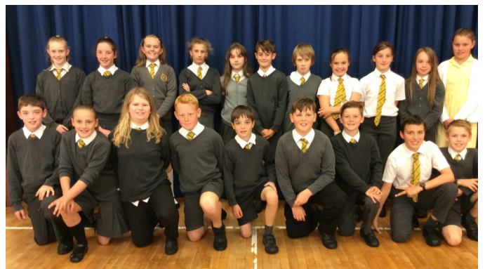
The Swimming Gala Finals Team