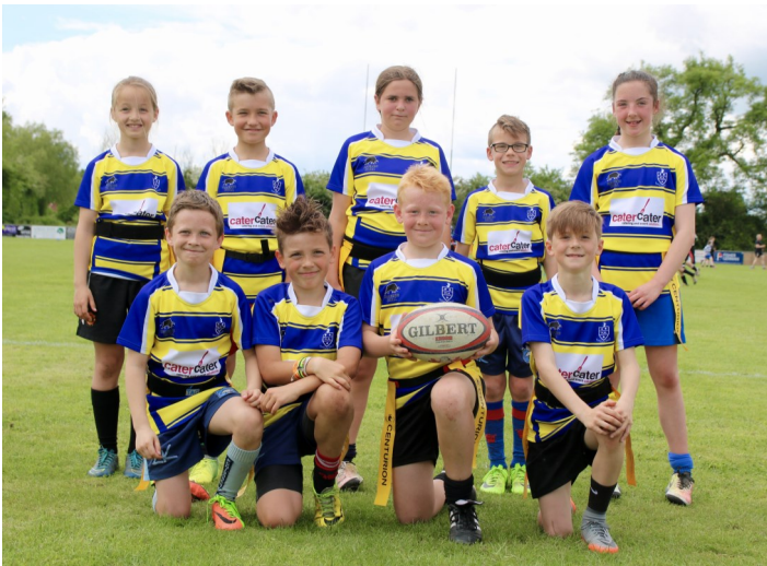
Highnam Academy Team 2 — Ledbury Winners